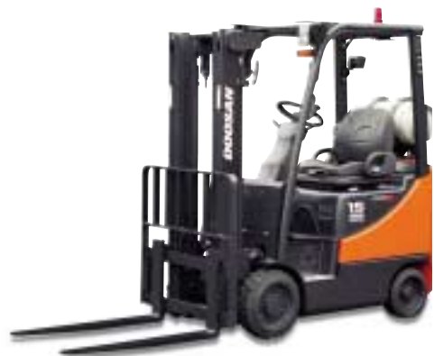
GC15S/GC18S-5 & GC20SC-5 1500kg, 1750kg, 2000kg Cushion Tire