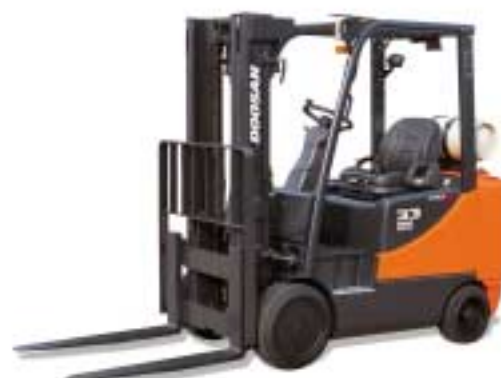
GC20E/GC25E/GC30E/GC33E-5 GC20P/GC25P/GC30P/GC33P-5 2000kg, 2500kg, 3000kg, 3250kg Cushion Tire